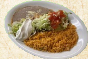
LUNCH BURRITO PLAYA