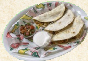
LUNCH BREAKFAST TACOS