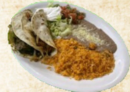
LUNCH TACOS SUPREMOS